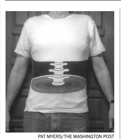
It looked more convincing in

● THE STYLE CONVERSATIONAL The Empress's weekly online column discusses the new contest and results. Especially if you plan to enter, check it out at wapo.st/ stylecony.